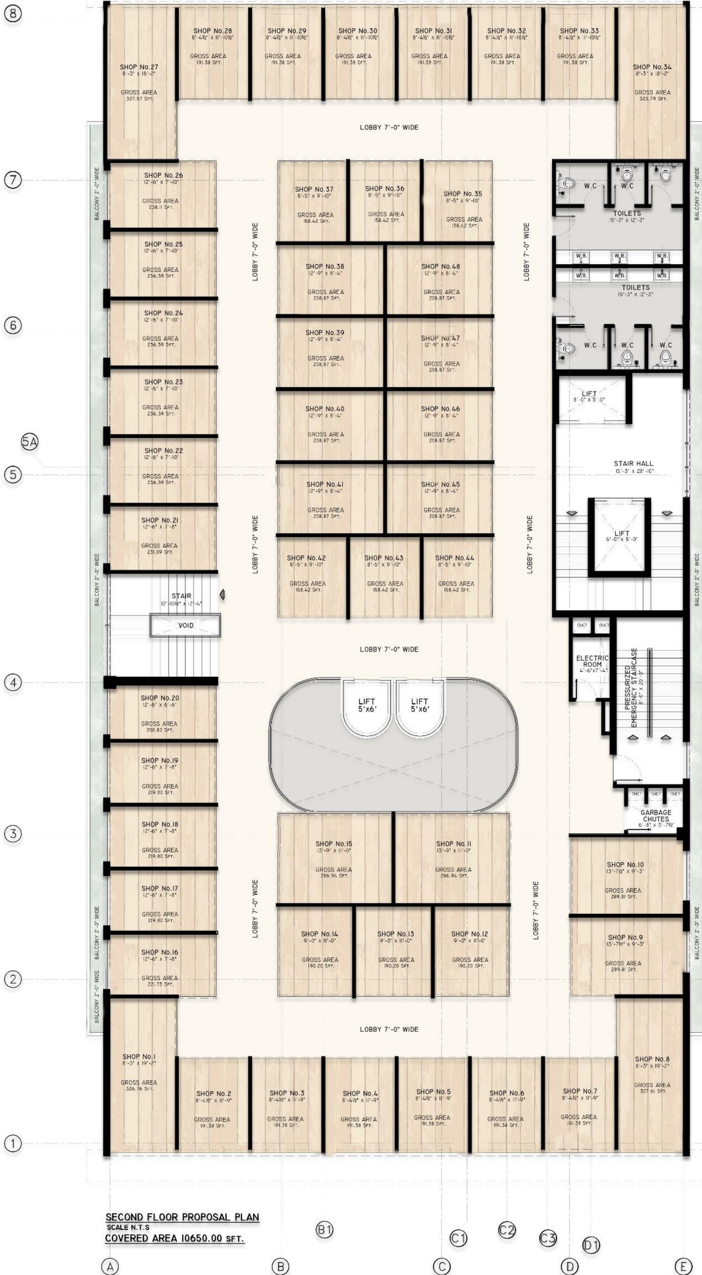
SECOND FLOOR PROPOSAL PLAN SCALE N.T.S. COVERED AREA 10650.00 SFT.