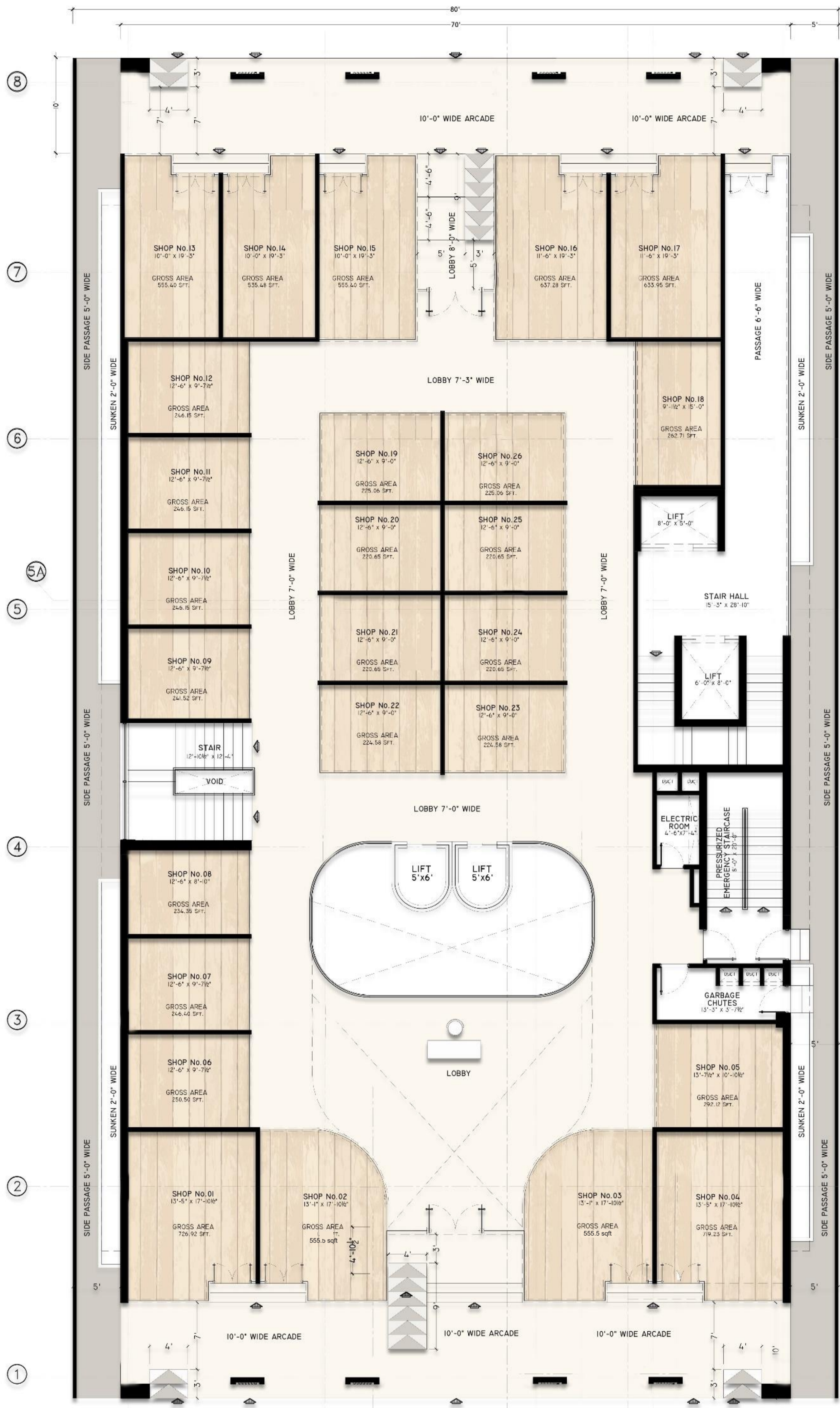
GROUND FLOOR BRANDED SHOPS PROPOSAL PLAN COVERED AREA 10613.80 SFT. SCALE N.T.S.