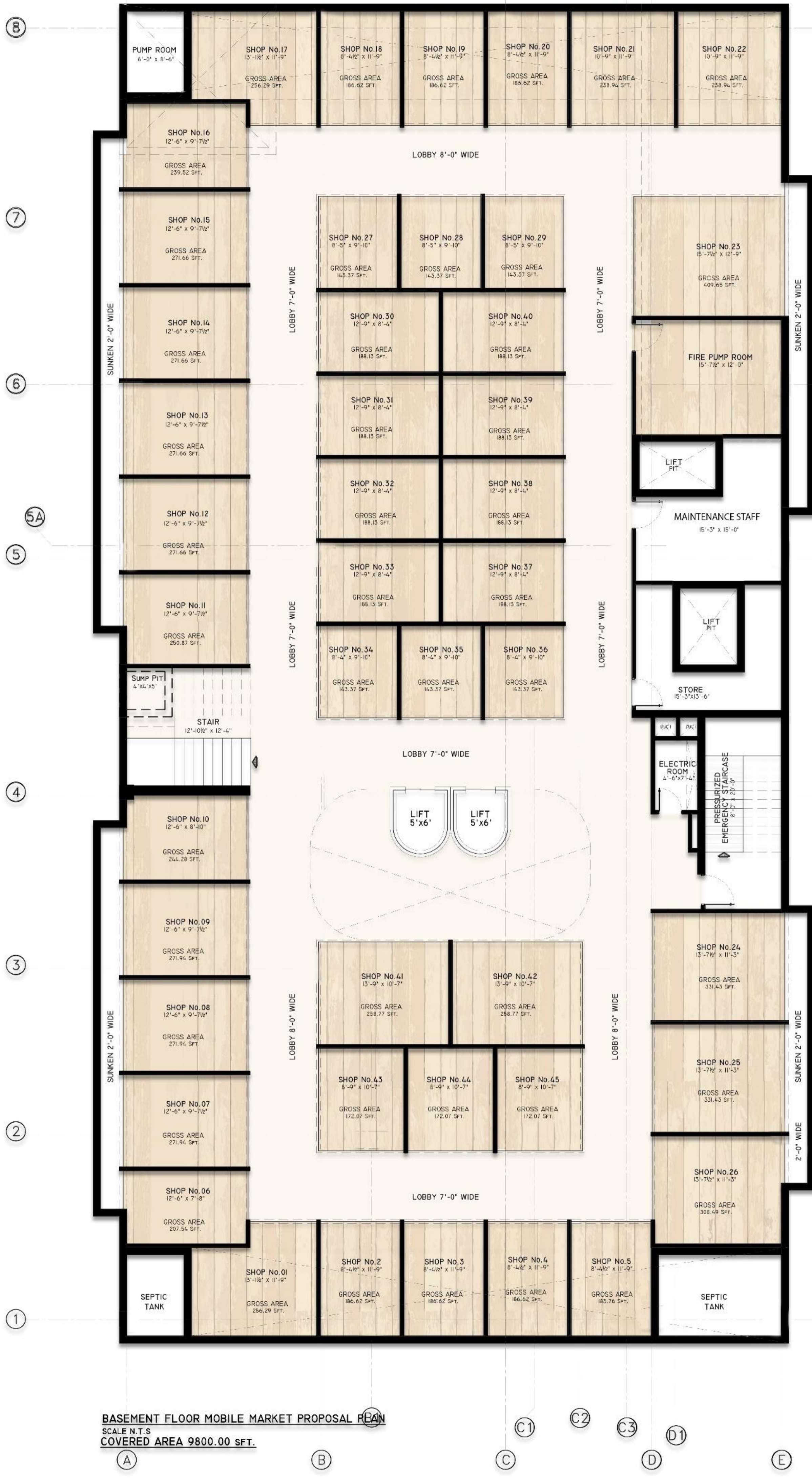
BASEMENT FLOOR MOBILE MARKET PROPOSAL PLAN SCALE: N.T.S. COVERED AREA 9800.00 SFT.