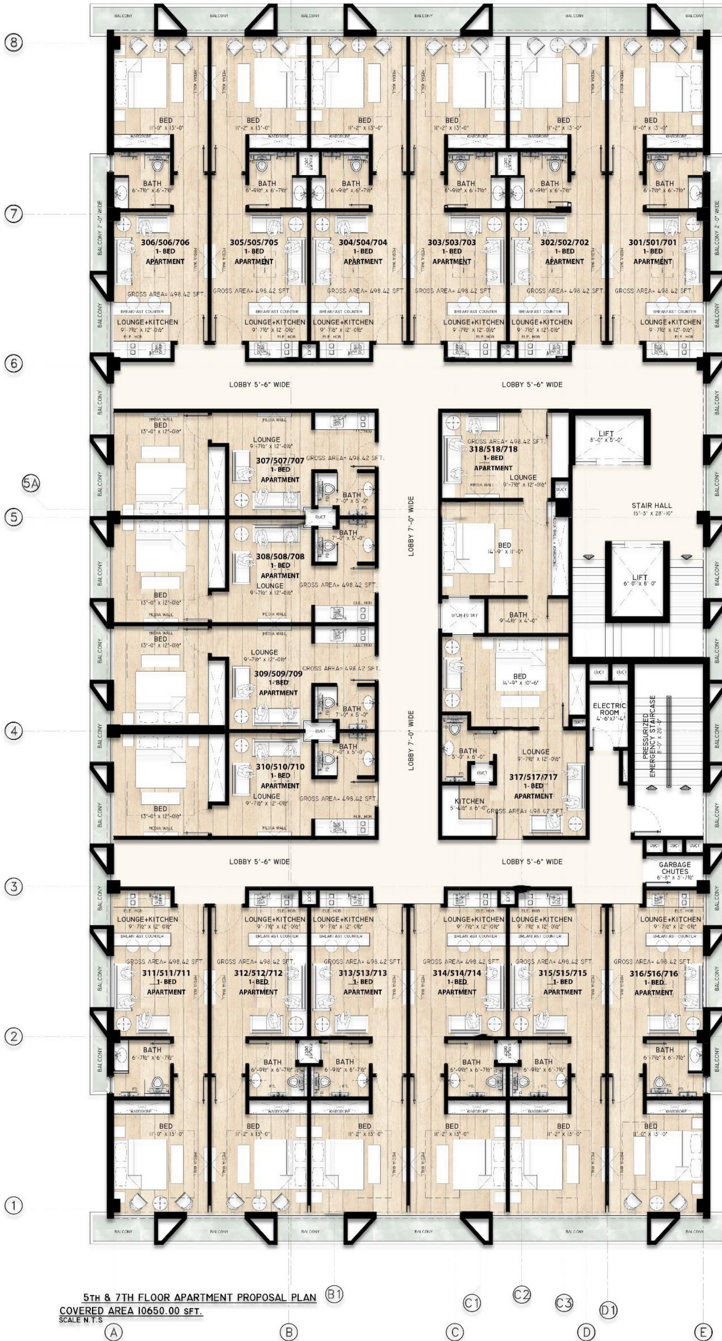
5TH & 7TH FLOOR APARTMENT PROPOSAL PLAN COVERED AREA 10650.00 SFT. SCALE N.T.S.