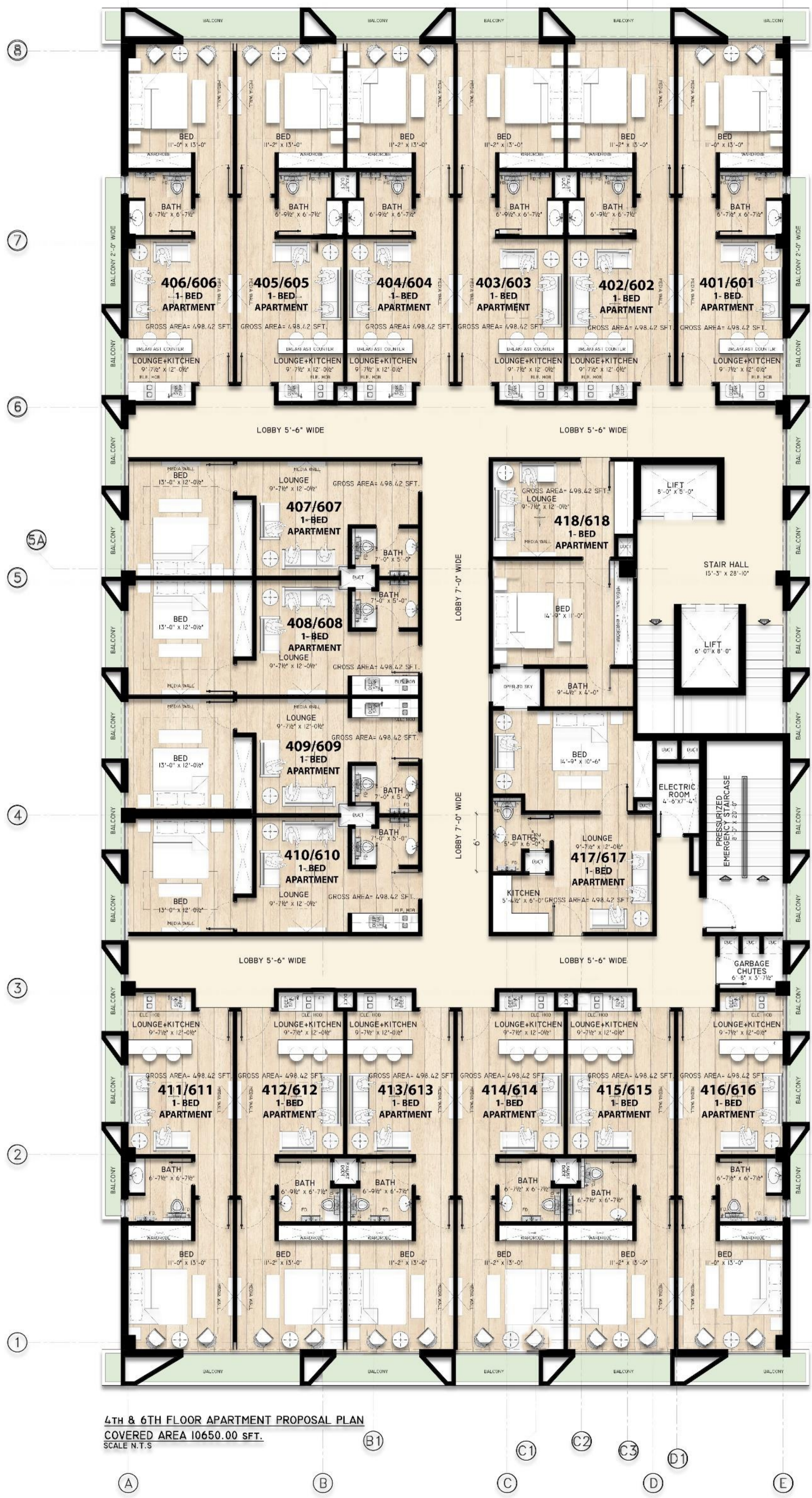
4TH & 6TH FLOOR APARTMENT PROPOSAL PLAN COVERED AREA 10650.00 SFT. SCALE N.T.S.